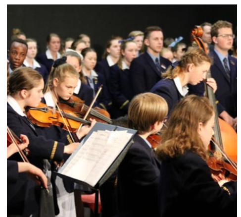
Hamilton and Alexandra College String Orchestra

AMEB Ensemble Performance examinations offer ensembles goals to work towards, feedback from a specialist AMEB examiner and recognition of their achievements. Examinations are available across eight grades and two diplomas in Strings, Woodwind, Brass, Percussion and Mixed Ensemble.