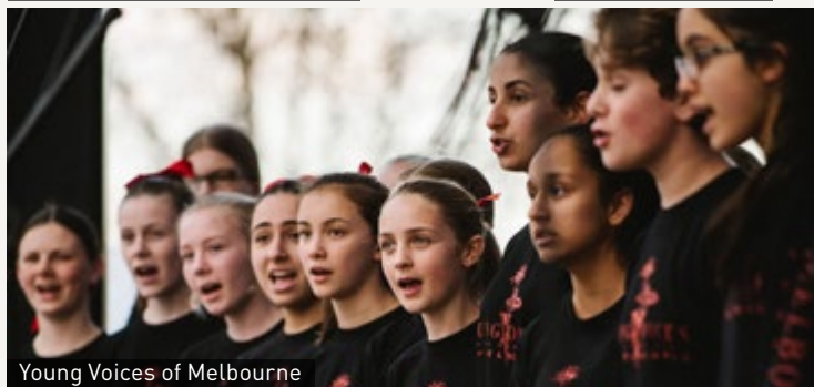
Young Voices of Melbourne