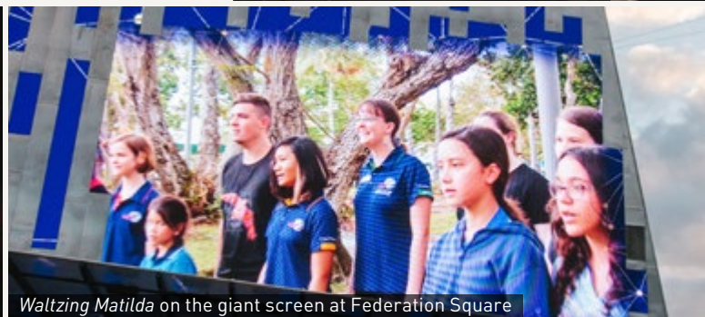
Waltzing Matilda on the giant screen at Federation Square