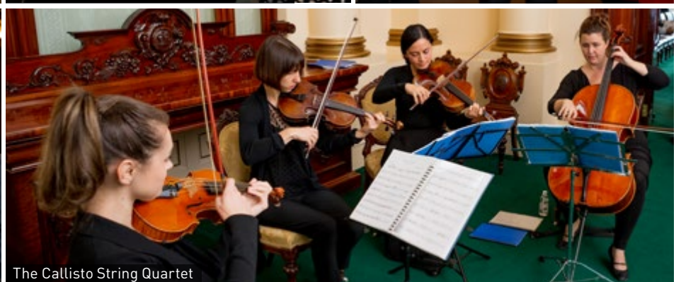
The Callisto String Quartet