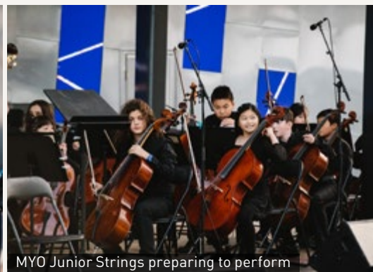
MYO Junior Strings preparing to perform