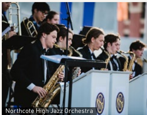
Northcote High Jazz Orchestra