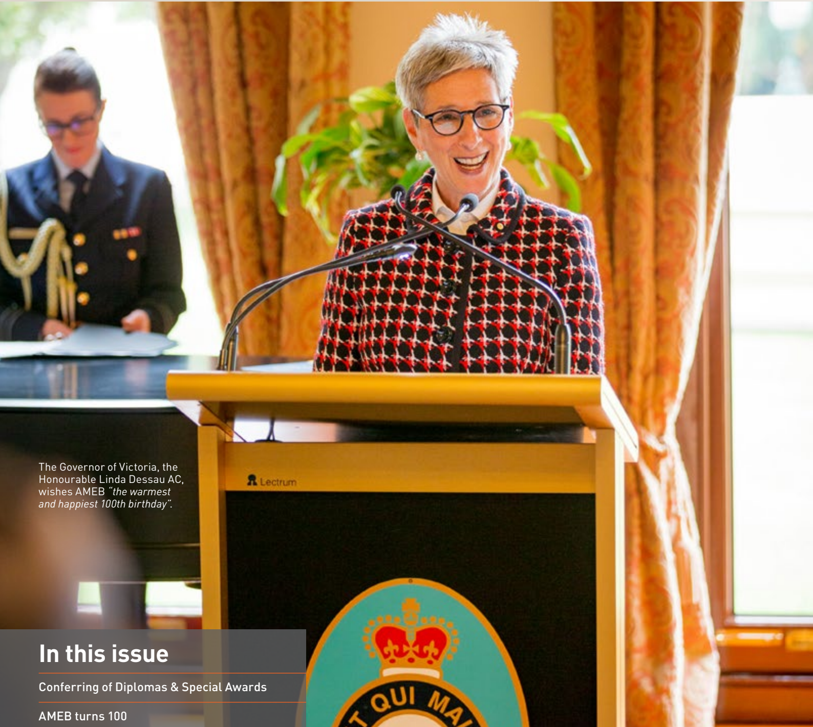
The Governor of Victoria, the Honourable Linda Dessau AC, wishes AMEB "the warmest and happiest 100th birthday".